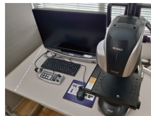
Microscope Analyzing adhesives thoroughly for further development.