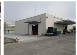
The first and the second material warehouses are under construction.