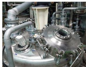
The 5000L Stirrer A pot for producing adhesives.