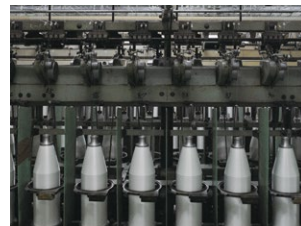
For seat belts A machine which twists yarn for seat belts.