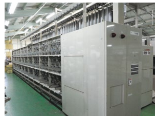
False twisting machine: A machine which processes yarn so that it stops material ends from fraying.