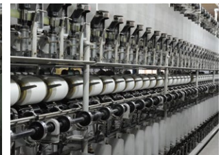
For No.50-count sewing yarn: A machine which processes No.50-count lock-stitching yarn.